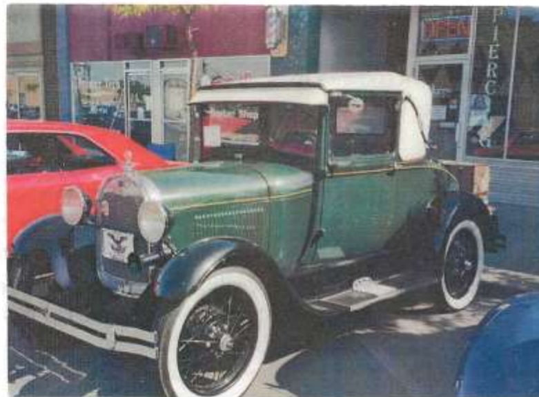
Another look at Joe Kuhns car in a car show in downtown Kennewick.