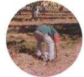
That's nut picken fer ya.