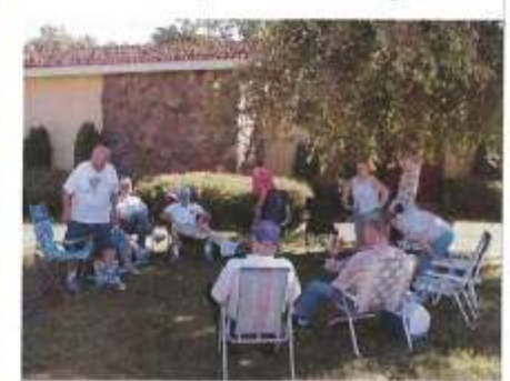
Of course there was food