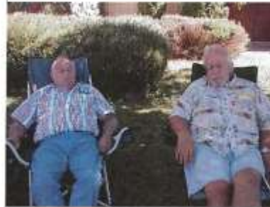
Don't they look excited?