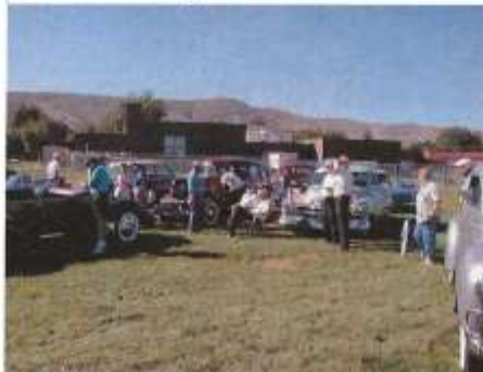
Had a good crowd 2002.