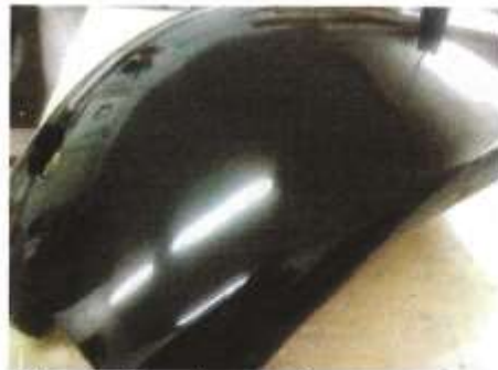
Got it fixed, not by a professional but by me the novice. Good HUH?

I also did some work on the dashboard. You should have seen it before I started.