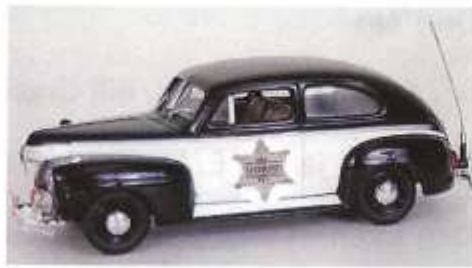
This is what I want it to look like.