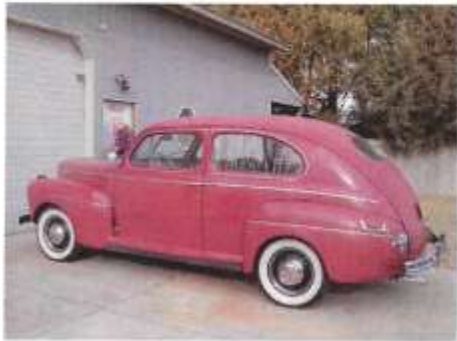
This is what it looked like when I bought it