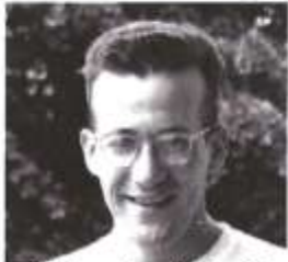
Who is this ?