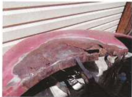
This is some of the problems I ran into along the way.